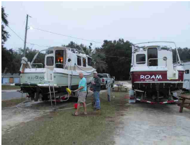
Back on the Trailers in a KOA

Roam is currently in storage at Rich's dad's house in Leesburg, Florida. We'll return to Florida again this winter for a cruise down to the Keys with a possible side trip to the Bahamas.