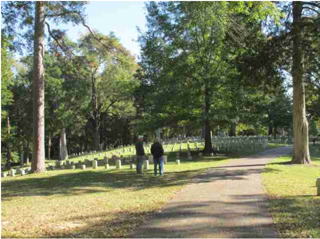
Somber Moment at the Civil War Battle Field, Shiloh, Tennessee