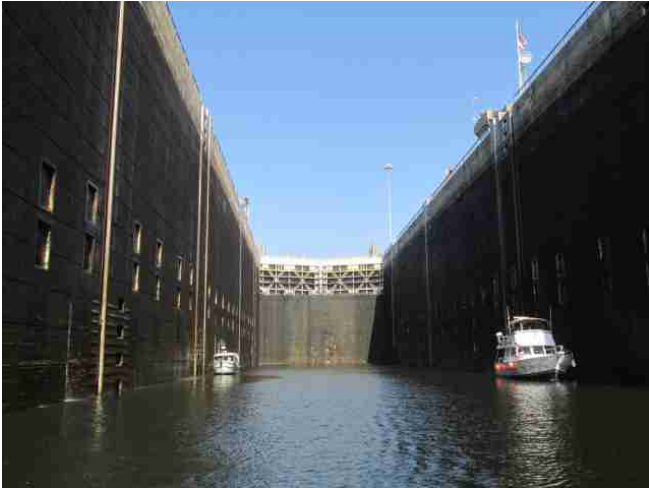
Inside One of 13 Locks