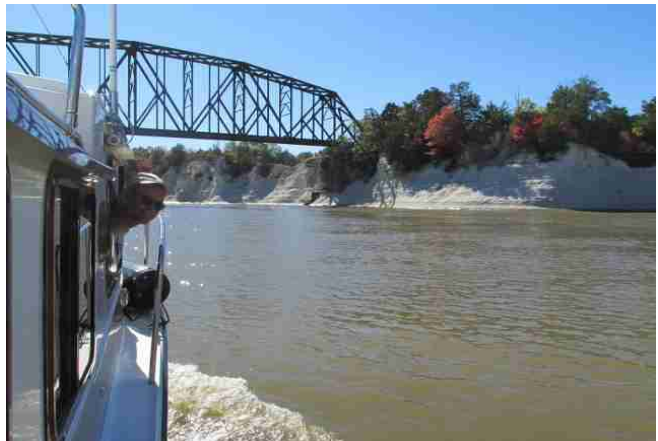
The White Cliffs at Epes, Alabama