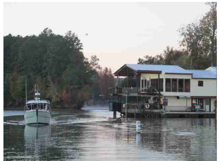
Rustic, but Nice People at the Mermaid