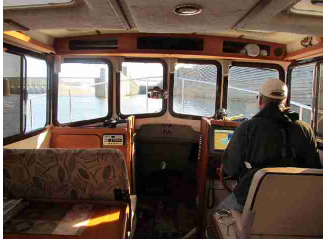
Rich is on the Edge of His Seat Entering Lock