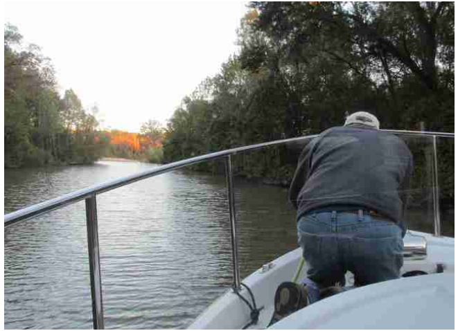
Picking up the Hook at Bashi Creek