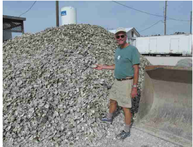
Discarded Oyster Shells