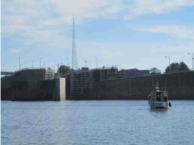
Illusions is Dwarfed by the Pickwick Lock