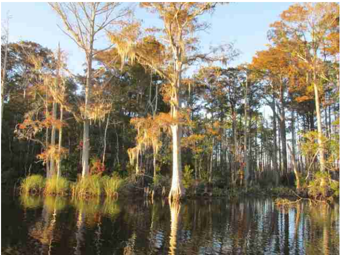
Final Florida Anchorage