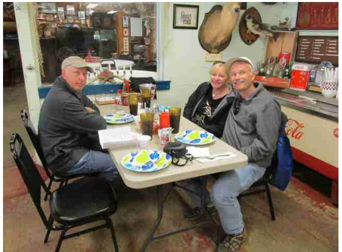
Dining at Bobby's Fish Camp