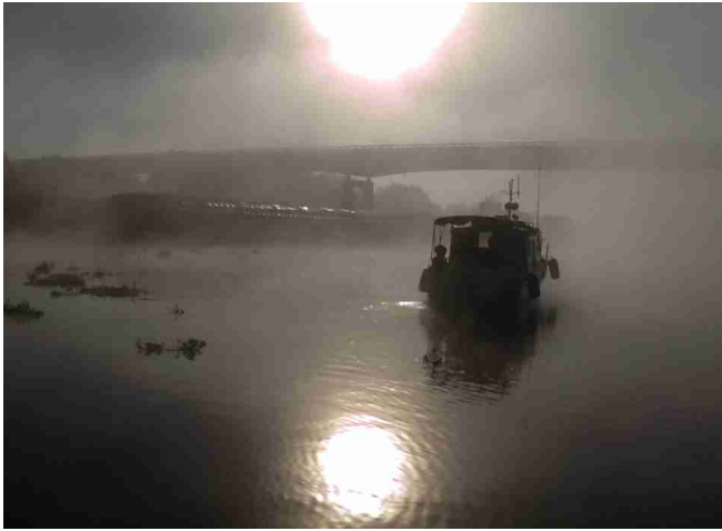
A Tug with Barges Emerges from the Fog