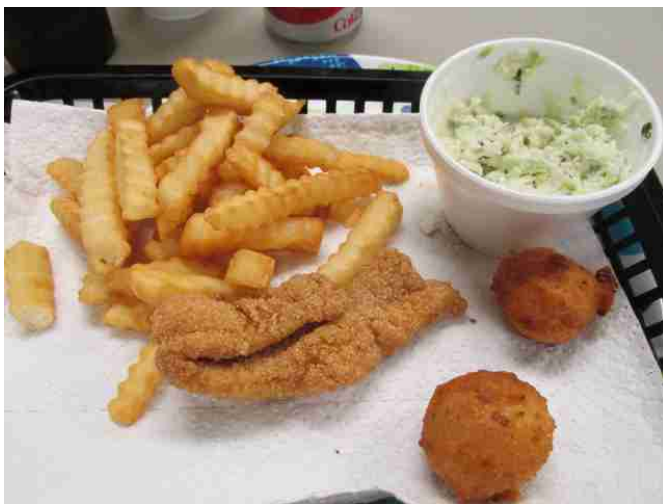
Bobby's Catfish with all the Fixin's