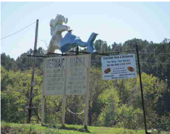
Mermaid Marina Three-Dimensional Sign