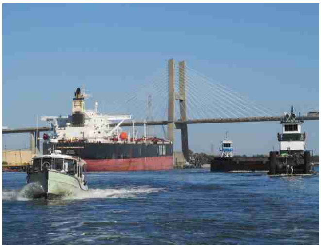
Back to Civilization Dodging Traffic in Mobile, Alabama