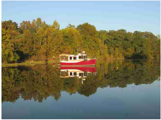
Reflections of Roam at Anchor