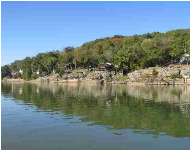
Scenery Along the Tennessee River