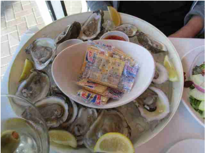
Oysters are Cheap along the Gulf Coast