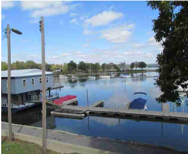
Kenlake Marina, Kentucky