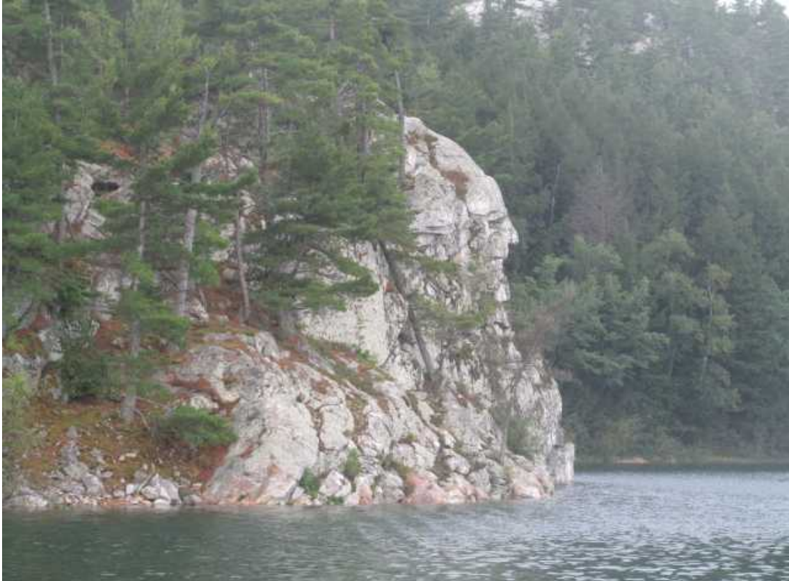
Happy Hour in Covered Portage Cove