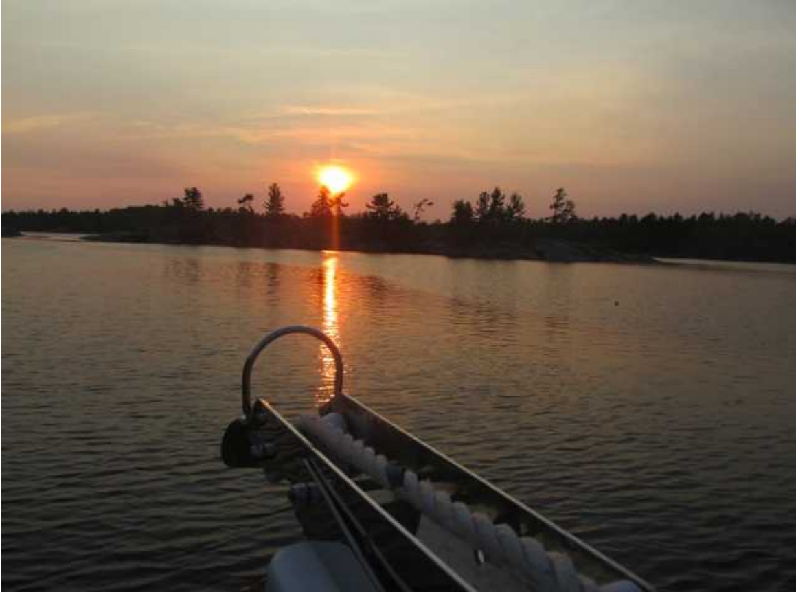
Overlooking the Spanish, Ontario Municipal Marina