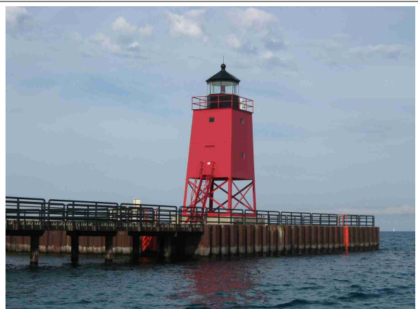
Charlevoix, Michigan Outer Channel Light