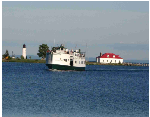
Beaver Island Ferry Arrives