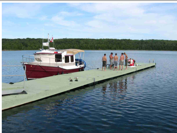
We were unaware that the Tolsonville town dock is also the swimming pool and social center.