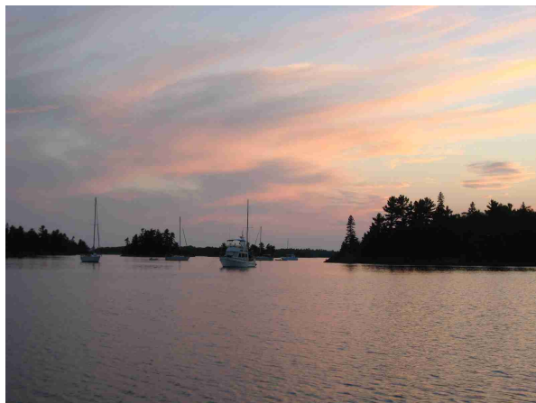
Sunset at Turnbull Island