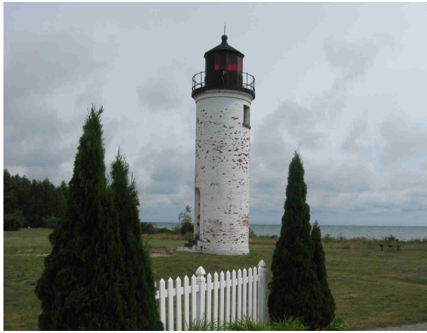
Beaver Island, Michigan Lighthouse