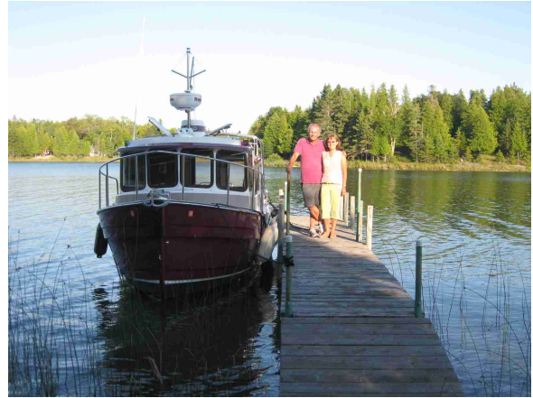
Lynne Coulter's Dock on Drummond Island