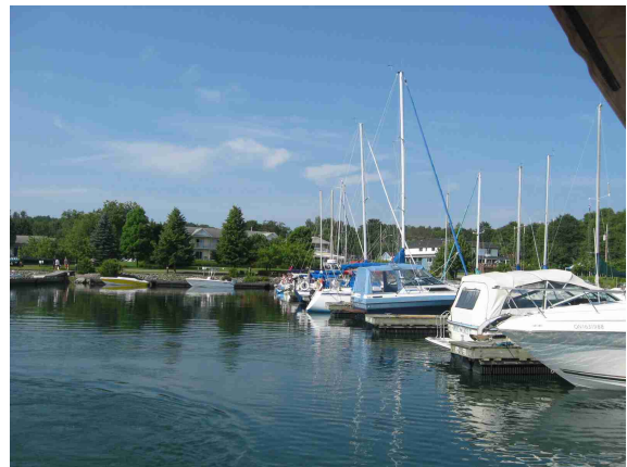
Hilton Beach, Ontario