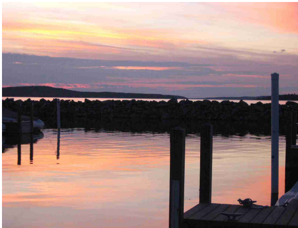
Sunset at Boyne City, Michigan