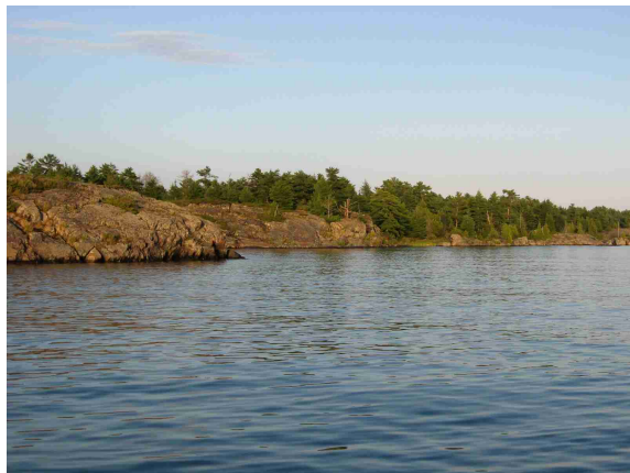
North Channel Scenery