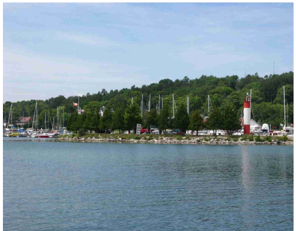
Gore Bay, Ontario