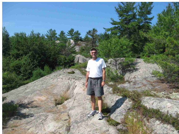
Rich Rock Climbing