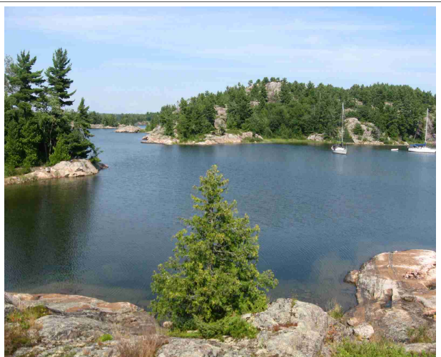
Long Point Cove