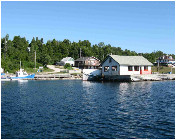
Meldrum Bay, Ontario