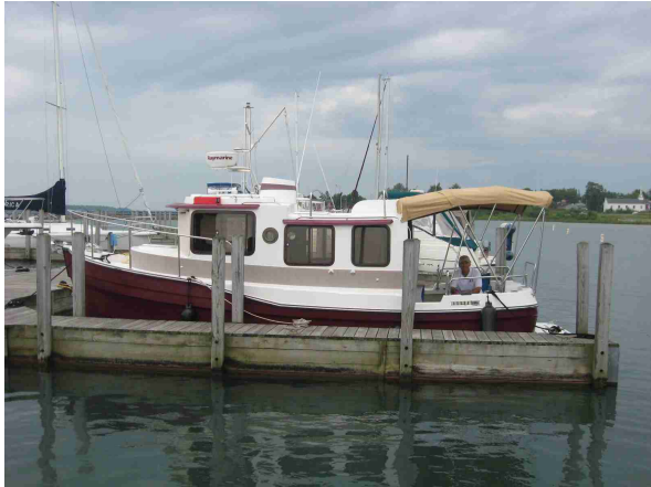
Detour Village Marina