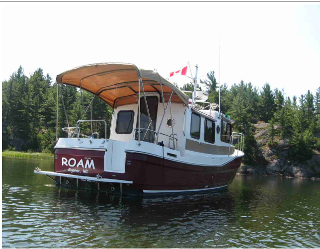
Anchored in 38 Inches of Water