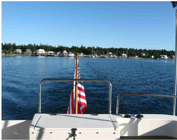
Departing the Beaver Island Harbor