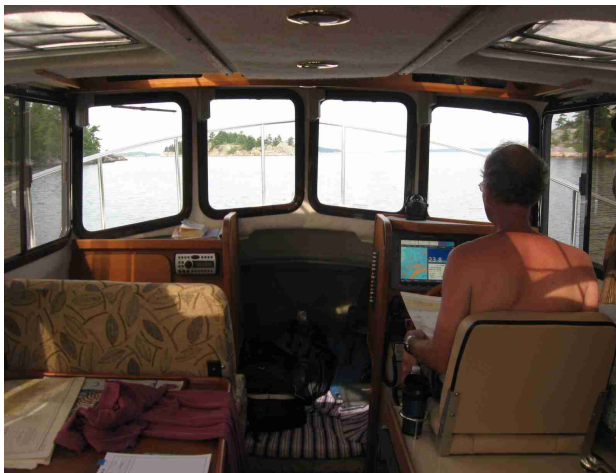
Tricky Navigation in Places