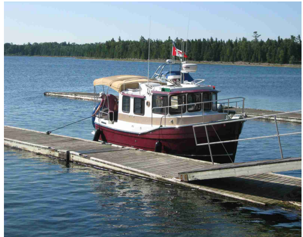
Marina in Meldrum Bay