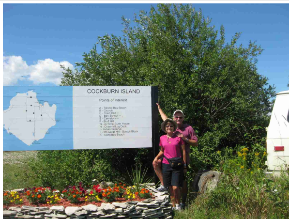
"Visitors Center" on Cockburn Island; The dockmaster lent us the keys to the church, town hall and schoolhouse.